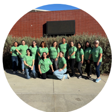
CCE in aGreenment with PFF, showing solidarity, for Governing Board Meeting.