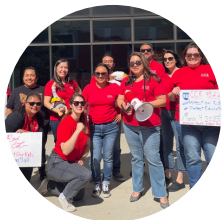
CCE and educators across the state wearing Red for ED. Defending public education!